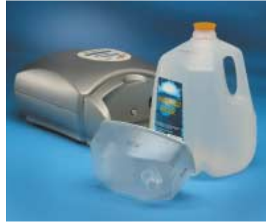
Water chamber is easy to fill. Distilled water is recommended.

The addition of humidification during CPAP therapy can help eliminate dry nose and throat discomfort and reduce nasal swelling. Invacare offers both heated and passover humidification options.