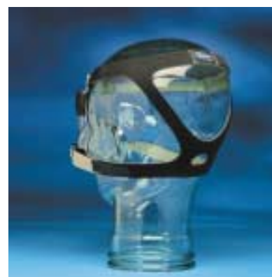
Flexible headgear with soft hook and loop fasteners allows for maximum adjustability and comfort.