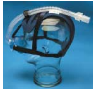
One-size headgear can be used as 2-point or 3-point for maximum adaptability.