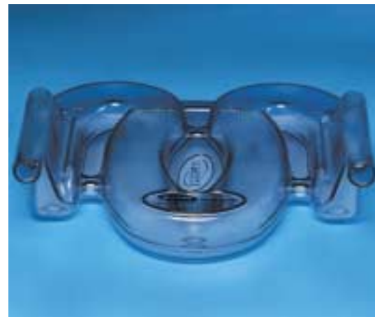
Invacare Poseidon passover humidifier.