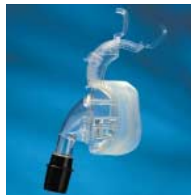
Six (6) forehead positions provide maximum comfort.