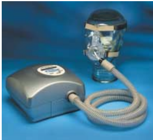
Invacare® Polaris™ EX™ CPAP shown with Invacare® Twilight™ Mask.