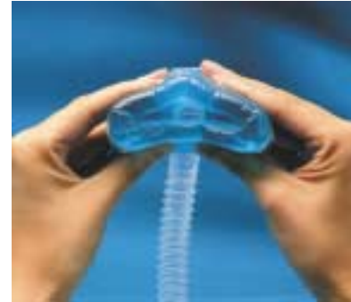
Adjustable sealing surface provides easy customized fit.