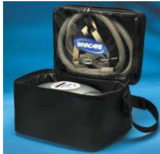
Attractive black carrying case designed to easily accommodate CPAP, tubing, mask and either the Polaris™ EX™ heated humidifier or Poseidon™ passover humidifier.