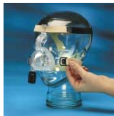
Quick-release clips make it easy to assemble/disassemble mask without changing headgear settings.